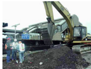
MTA/Metro-North Railroad Croton-Harmon Yard 21

Matrix's experience in this field includes work for clients such as NJ Transit, MTA, Metro North, and NYC DDC.