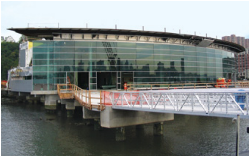
Port Imperial Ferry Terminal

Matrix's experience in this field includes providing inspection services on major transportation and infrastructure projects throughout the New York and New Jersey area. We have worked for clients such as NJ Transit, MTA, Metro North, and NYC DDC.